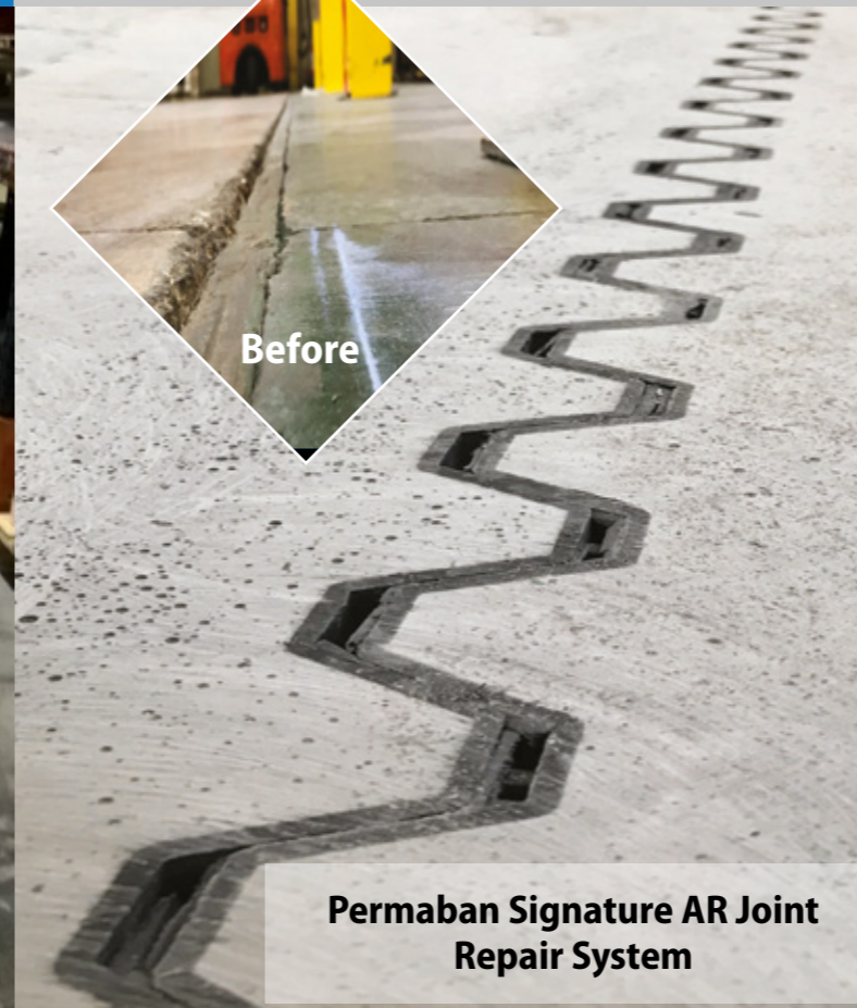
Permaban Signature AR Joint Repair System